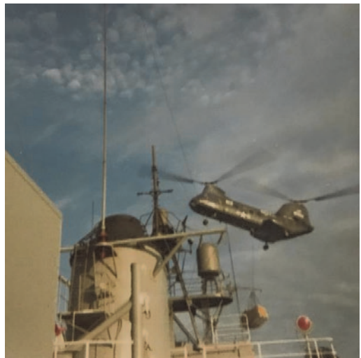
Christmas Eve 1965, Vietnam

Pulling away from CVN-65 U.S.S. Enterprise.... Call sign "Climax" Christmas Eve, 1965