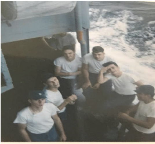
Heading Home from Nam